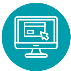
Online, digital and electronic arts