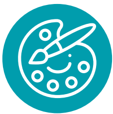
Visual arts, design and craft

The Health Evidence Network (HEN) synthesis report on arts and health, which will be launched on 11 November 2019 , maps the global academic literature on this subject in both English and Russian. It references over 900 publications , including 200 reviews covering over 3000 further studies . As such, the report represents the most comprehensive evidence review of arts and health to date.